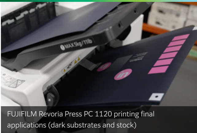
FUJIFILM Revoria Press PC 1120 printing final applications (dark substrates and stock)

And the numbers, just since commissioning in late 2023, tell a compelling story of growth and efficiency: a 35-40% increase in productivity (time saving as well as increased volume), coupled with an emerging understanding of the possibility of a 30-40% increase in throughput even with the small existing team. These figures represent not just improved performance, but a fundamental shift in what’s possible for a small, regional print shop.