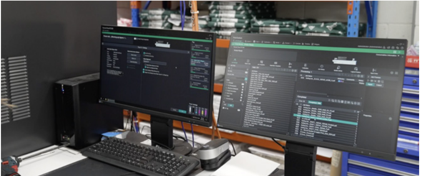
FUJIFILM Revoria Flow Digital Front End solution