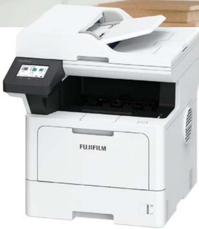
Apeos 4620 SX