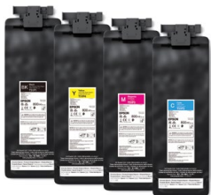
800 ml ink packs