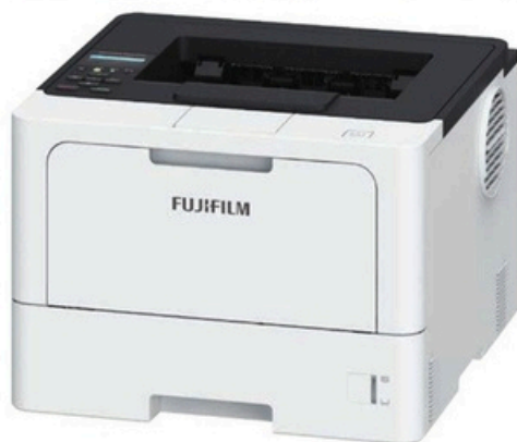
ApeosPrint 4620 SDW