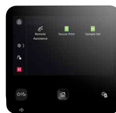
5-inch colour touch panel