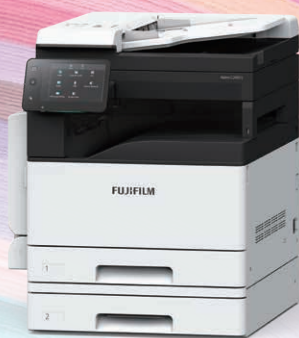
Apeos C2450 S with Optional Tray Module