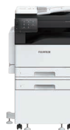
With Tray Module and Cabinet