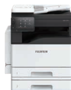
With Tray Module