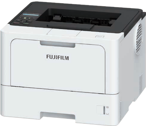
ApeosPrint 4620 SDW